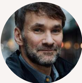
Keith Ferrazzi (2023)

Bestselling Author of The Big Leap and creator of the Zone of Genius and over 40 books on personal development