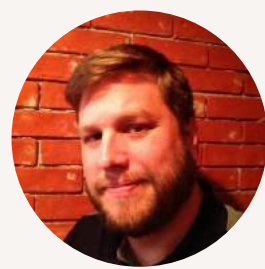
Deacon Wardlow Vantage LED

Great speakers, impressive and heartfelt leaders. Beautifully put together and a really excellent space to learn and grow!