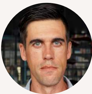
Ryan Holiday (2024)

Our events feature sought-after speakers in leadership, consciousness and human transformation, including: